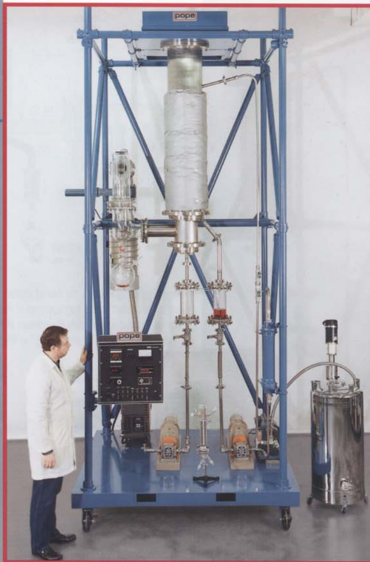
New Pope Molecular Wiped-Film Still System includes vapor trap, rotary vane and diffusion pumps, feed and discharge gear pumps, optional feed vessel with mixer, optional residue cooler, and optional control panel. (2" glass molecular lab still shown between discharge pumps for size comparison.)

▲ Joins standard still line with 10.5 sq. ft. of evaporative surface and feed rates up to 55 gallons/hour.